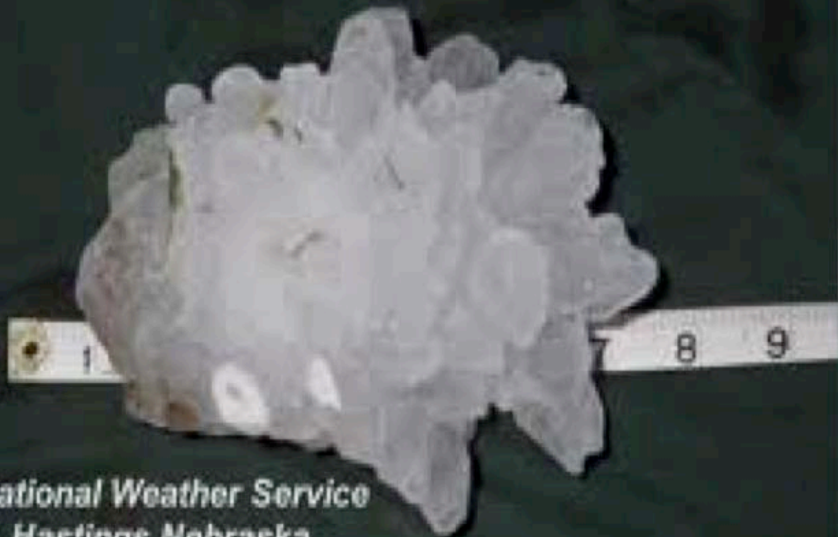
National Weather Service Hastings Nebraska