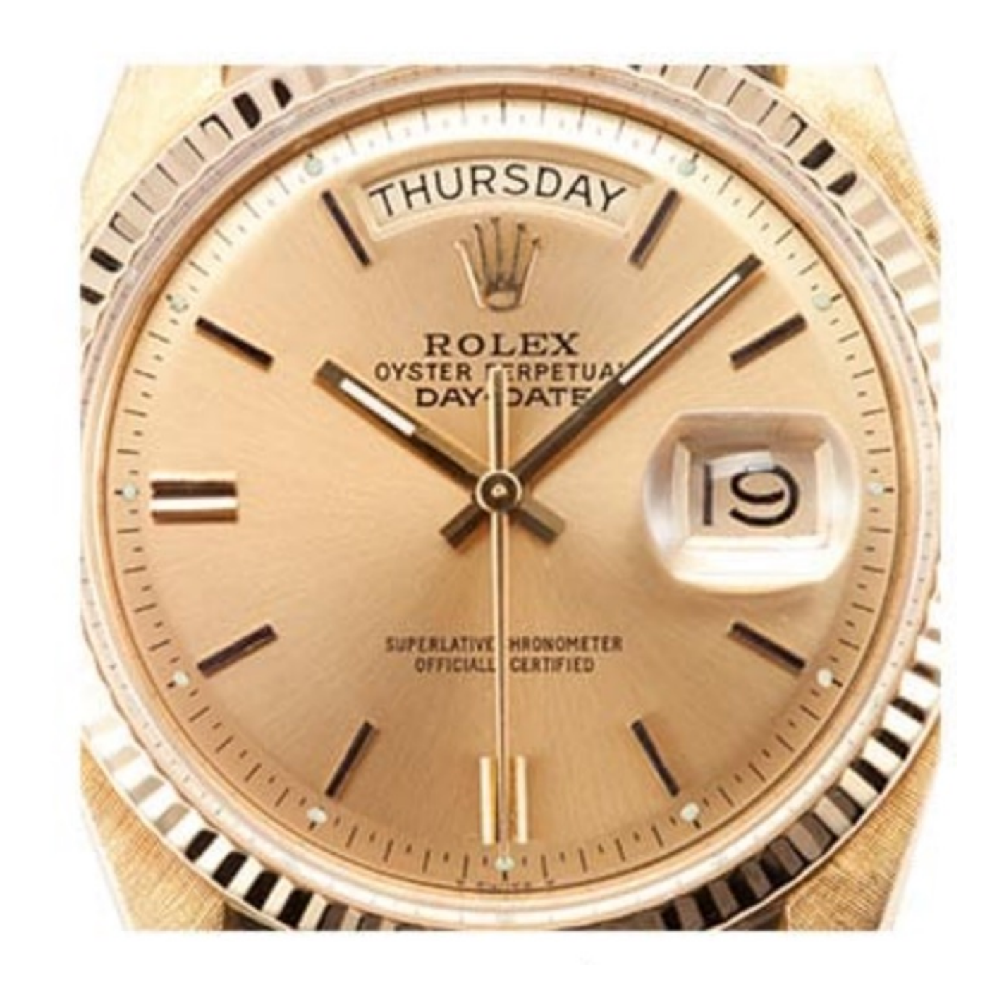
Fake $600 vs. Real $57,000