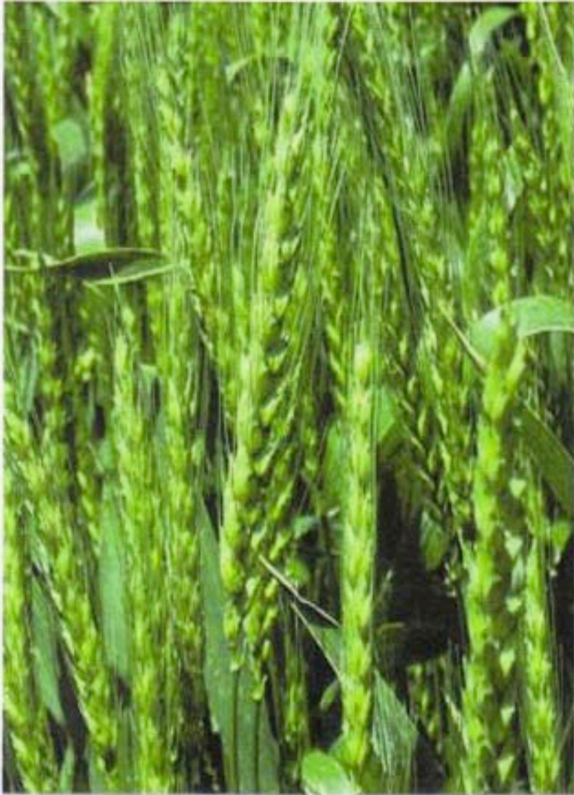
WHEAT: before it is fully ripe.