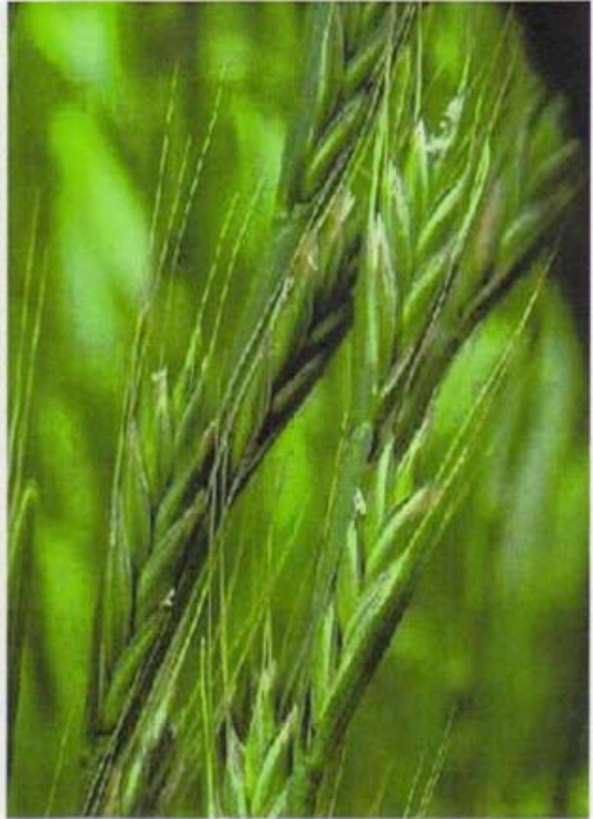
TARES: Lolium Temulentum